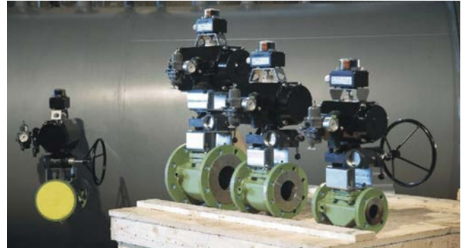
VALVES, INSTRUMENTATION AND AUXILIARIES